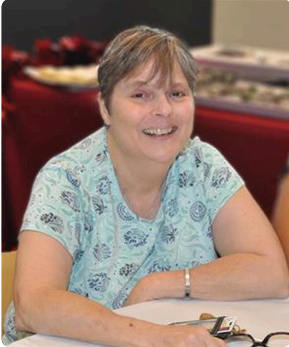
A smile that brought light to us all.